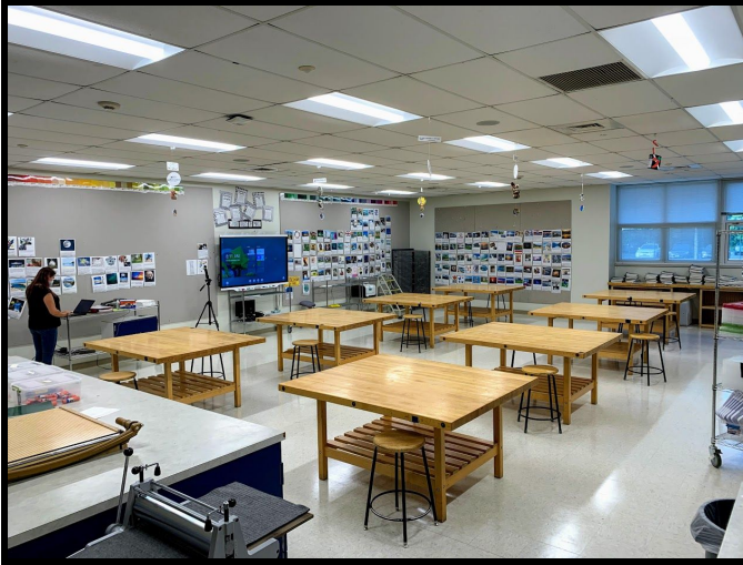
HYBRID ART STUDIO